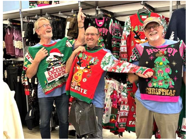
A zany Christmas sweater Habitat mission trip picture (right) and the full BLC – St. Luke’s Habitat team...