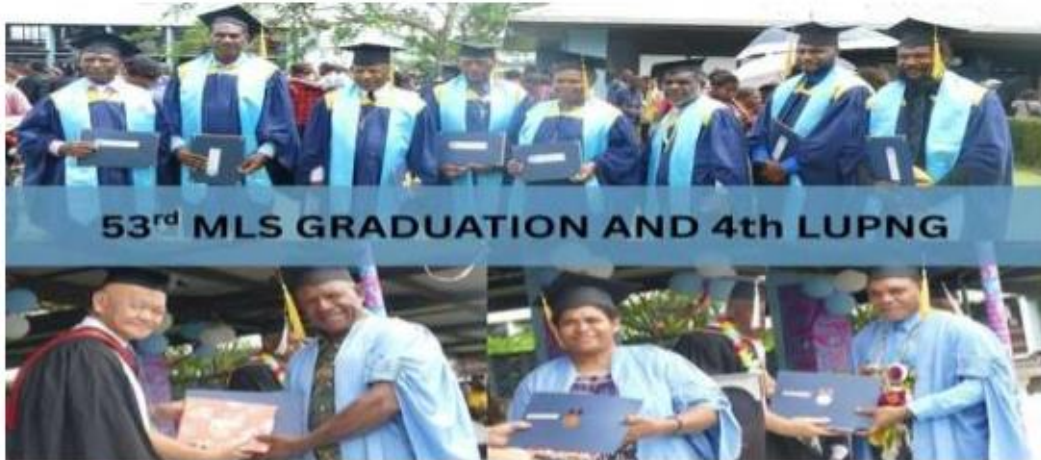
53 rd MLS GRADUATION AND 4 th LUPNG

On November 29, 2025 - in our companion synod (ELC-PNG) - a total of 19 students graduated with Diplomas and Degrees in Theology. Among them were four female graduates, three with Diplomas and one with a degree, reflecting ELC-PNG's ongoing commitment to encourage and support women in theological education. Martin Luther Seminary is part of the Lutheran University in Papua New Guinea, (LUPNG). The new pastors will serve throughout the country in the 1.5 million member church.