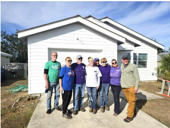
“Before and after” house painting picture from Sebring, FL in Nov.