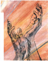
A Dance... and Flurry