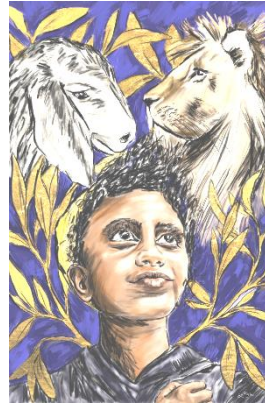
A Child Shall Lead Them (Garrity)

Look for images, reflections and your copy of the “What Can’t Wait?” devotional at Bethlehem starting November 30 th . (Please take one per family. We can print more if needed!)