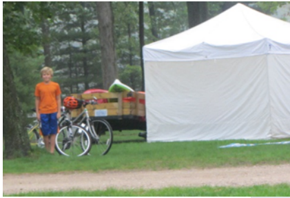
Bethlehem Camp Out at Turtle Lake