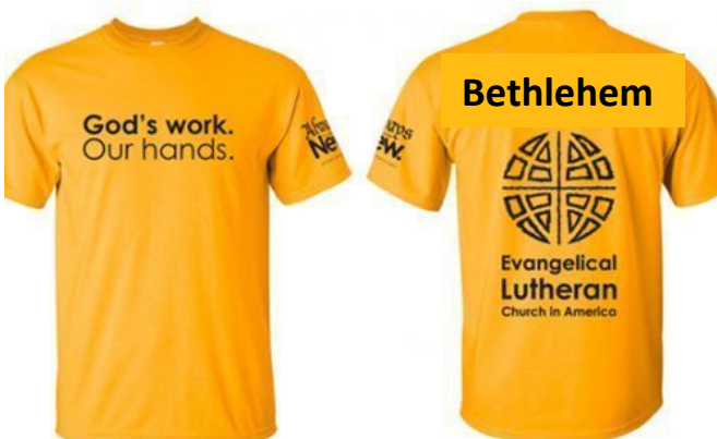
Our new ELCA “God’s Work, Our Hands” t-shirts, proudly displayed when out in the community!

The best answer is less about them, and more about US, as disciples. As another church’s mission statement once said, as disciples of Christ, “our mission is to be a church of disciples, who make disciples, who make disciples.” Of course, that mission was based on the Great Commission from Jesus’ words at the end of Matthew’s gospel. But its message rings true today as much as 2000 years ago. And when we deepen our sense of discipleship, and spread that knowledge, relationship and love to others...We indeed co-create something bigger with Christ: a church that does God’s work with the hands and feet of His disciples.