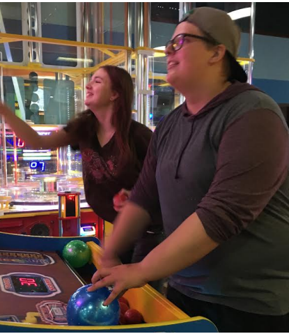
Senior High Night @ Incredible Mo's