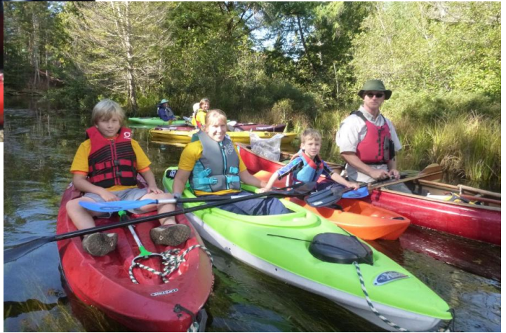
Upper Manistee River Clean Up Yellow Shirt OP