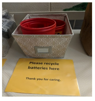
Bring your "spent" batteries to our caring center (please put tape on the ends for safety purposes).