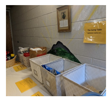
Our Caring Center

CHRISTMAS SHOPPING----When you see those HUGE packs of batteries while out shopping this month (like on Black Friday), please consider buying rechargeables and a charger. You will be doing your part---batteries that are thrown out emit greenhouse gases which cause climate change.