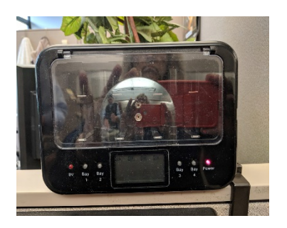
Our battery charger. The microphones and electronics here all use rechargeables.

REUSE—reuse the bag, donate old sheets to the quilters RECYCLE—Paper, plastic, metal, batteries, etc.