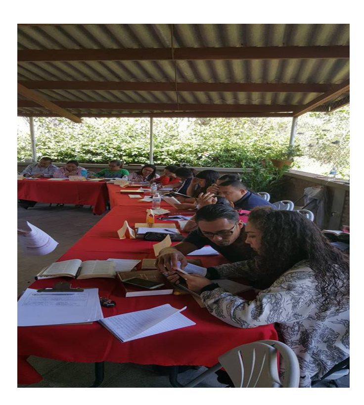
Iglesia Luterana Christiana de Honduras

We have heard so much recently about the situation in Honduras, a nation often dealing with violence, crime, gangs and fear. The small Lutheran church in Honduras has struggled since its founding in 1951. In the past, two of its pastors were murdered outside their church buildings. Today there are hopeful signs in the midst of those fleeing persecution in Honduras. Many people remain because it is their home country. Faith in the future dwells deeply within.