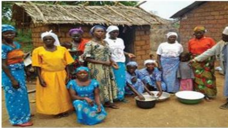
Two church bodies working together providing medical care and care for refugees.

This year the evangelical Lutheran churches in Cameroon (EELC) and the Central African Republic celebrated 100 years of ministry. Lutherans from both churches and from the ELCA gathered in Minneapolis, Minn., at the Sudan Mission Centennial Celebration to mark a century of partnership. The conference featured discussions with the president of the Evangelical Lutheran Church of the Central African Republic and the bishop of the Evangelical Lutheran Church in Cameroon, as well as former missionaries to the region.