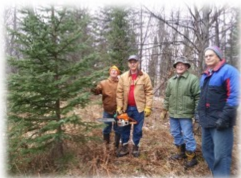
Cutting down the Christmas tree for Bethlehem's sanctuary