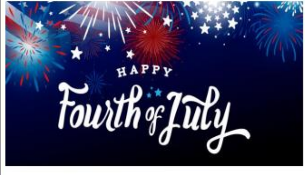
-Christian Education Committee