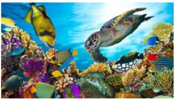
We had an AWESOME day diving into God's promises at Great Bible Reef! Thank you to all our fantastic volunteers

We are fervently praying each and every day for our precious Sunday School children and their families! May God bless all of you with safety and good health until we can meet again!! Jesus loves you VERY much, and so do we!!!