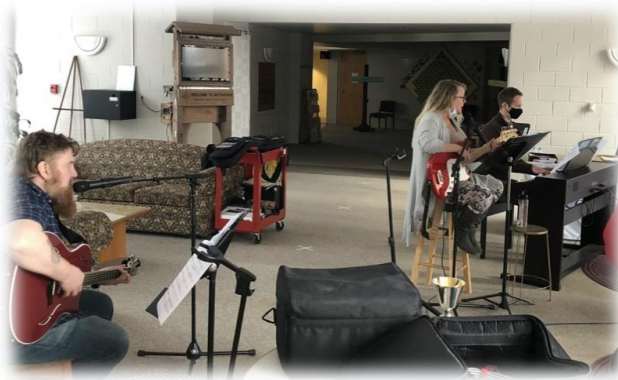
Table for 12