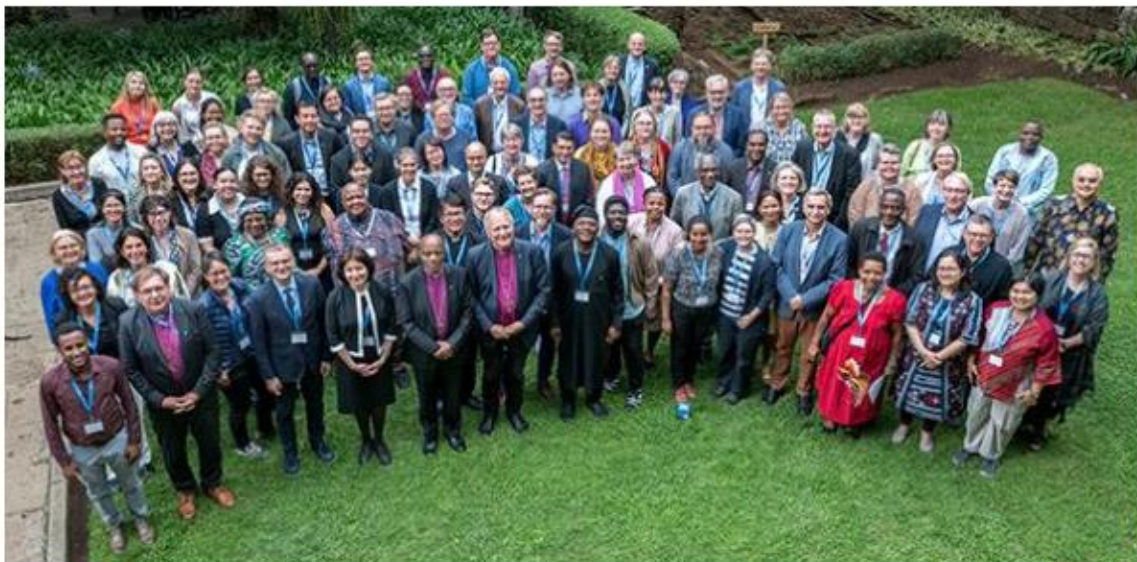
Participants in the 2025 Lutheran World Federation Council meeting gathered in Addis Ababa, Ethiopia, under the theme "Be My Witnesses."

The Lutheran World Federation Council meeting took place in Addis Ababa, Ethiopia, June 11-16 and was attended by ELCA Global Mission staff. At the meeting, council members adopted new public statements, decided the location of the 14th LWF Assembly and worshiped at local congregations. The LWF council also approved the full membership of four new churches into the Lutheran World Federation: the Lutheran Church in Cambodia, the Gereja Niha Keriso Protestan Church in Indonesia, the Manupur Evangelical Lutheran Church and the Bodo Evangelical Lutheran Church.